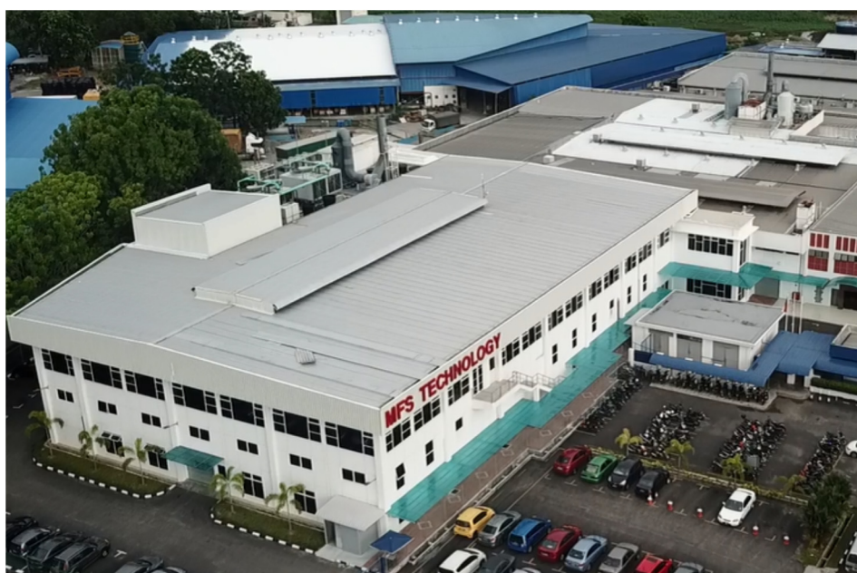
New State-Of-The-Art Malacca Factory photo